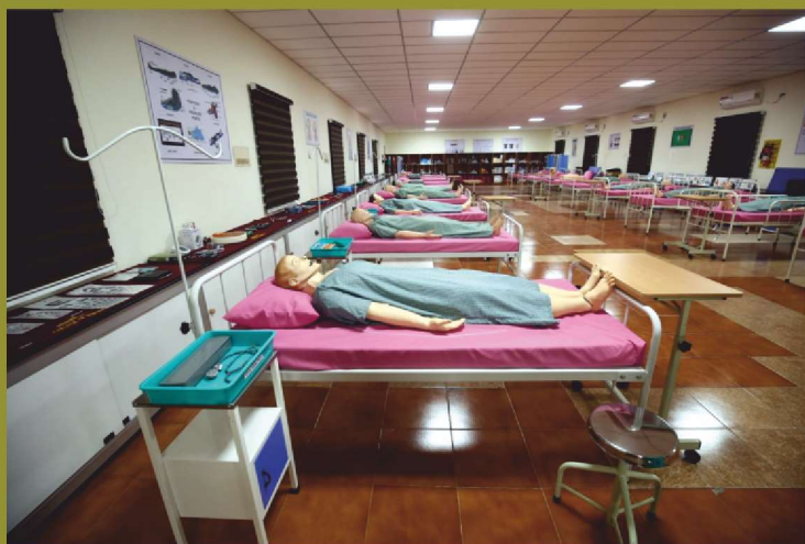
Nursing foundation Lab

We have spacious with fully equipped laboratories where various procedures have been